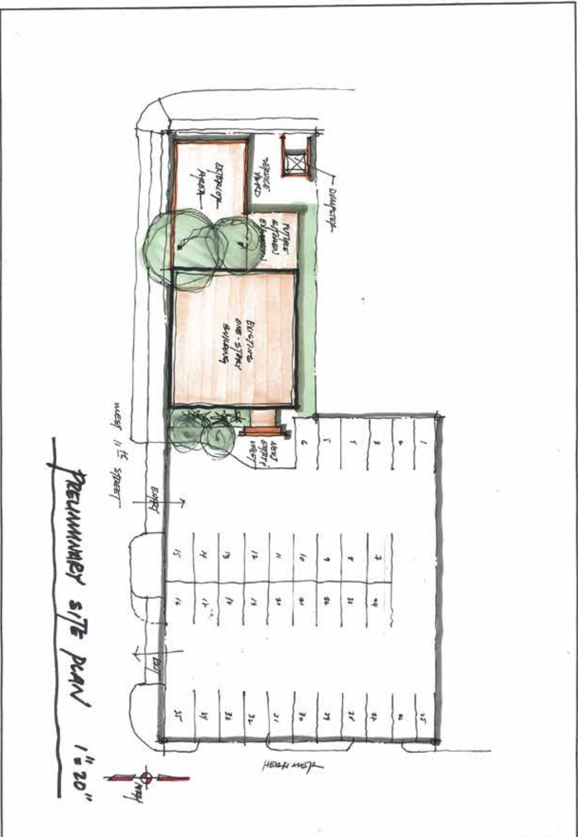
Preliminary site plan 1" = 20"